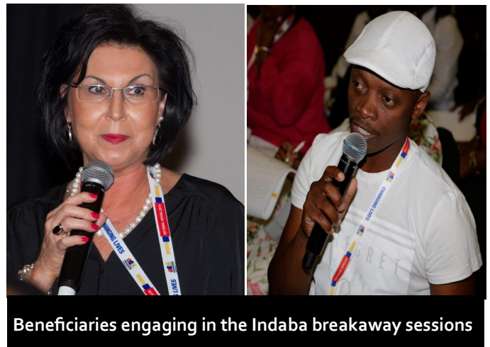
Beneficiaries engaging in the Indaba breakaway sessions

Ensure processes and procedures are fair, ethical, transparent and professional, and deliver on the NLC's espoused values