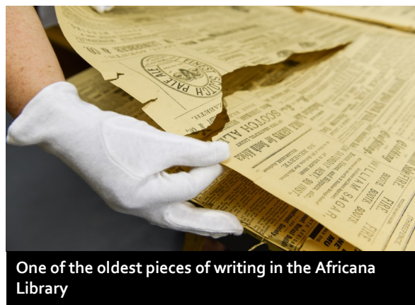
One of the oldest pieces of writing in the Africana Library

Remember! Check out website www.nlcsa.org.za for regular updates! Visit the News and Events page for media statements and details of events.