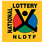
Old logo for beneficiaries

As previously communicated, the rebranding of the National Lotteries Board as the National Lotteries Commission also included the change of the logos. For beneficiaries publicity, the NLDTF logo will no longer be used. A new NLC logo with the words 'LOTTO FUNDED' will now be used to show the impact of funding on all beneficiary publicity.